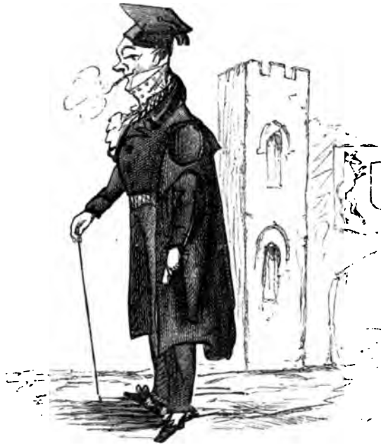
THE DON SMOKING